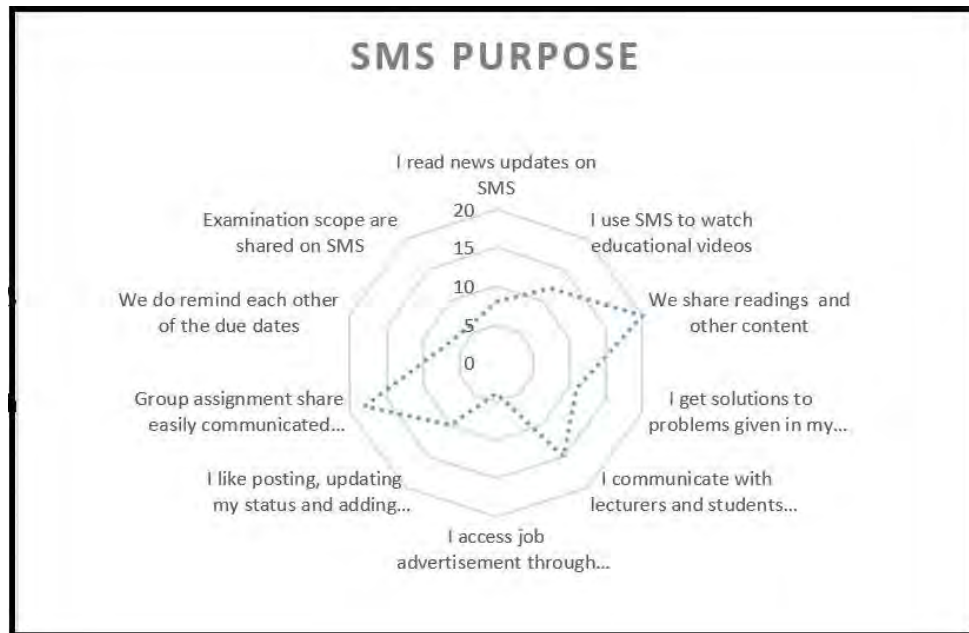
Figure 2. the purpose of using SMS.

content(Singh, 2018). This suggests that it is now high time for universities to adopt and use SMS for learning, since their connectedness affords students an opportunity to define their self-identities, and helps students to perform their science course activities beyond the classroom. In other words, informal learning (SMS) gives students autonomy to produce and consume science content through their social and personal experiences (Siemens & Downes, 2009). In line with this, the findings have shown in figure 1 and 2 that students are finding and making good use of SMS that ‘work best’ for them within their local context of learning science to serve their needs. Thus, universities have an obligation to shift to informal learning in order to support these useful and interactive informal platforms for learning to disseminate science content (Mpungose*, 2020c).